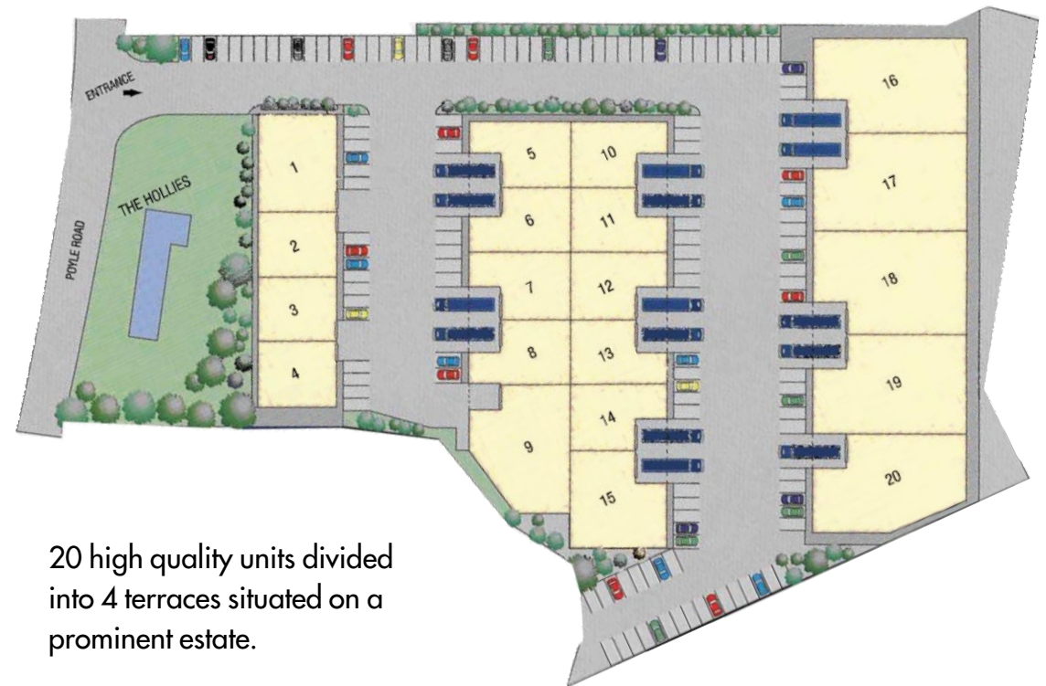
20 high quality units divided into 4 terraces situated on a prominent estate.