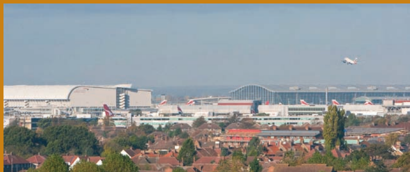
View from offices