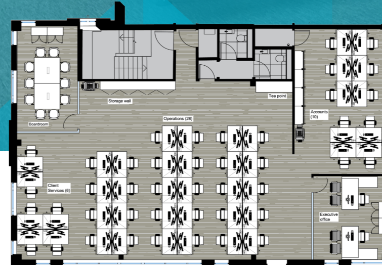
FIRST FLOOR Desks: 44 / Meeting Rooms: 2

TERMS: Available on a new lease direct with the Landlord. Further details on application