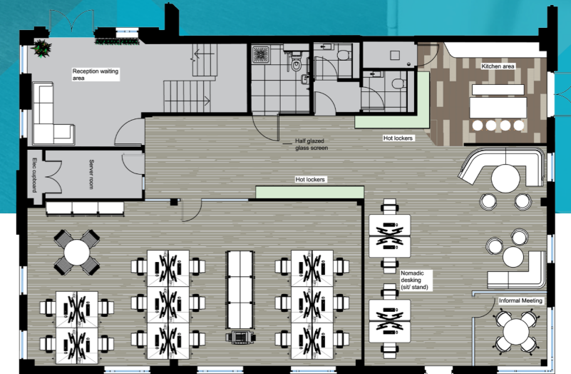
GROUND FLOOR Desks: 20 / Meeting Rooms: 1