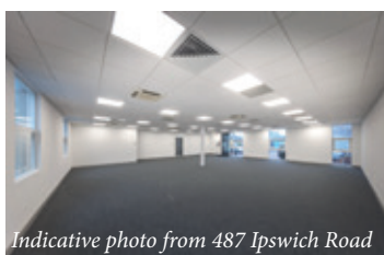
Indicative photo from 487 Ipswich Road